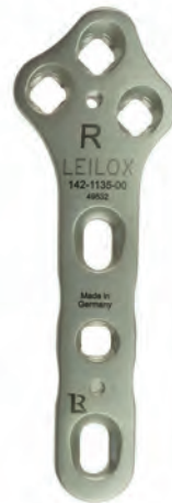
LeiLox TPLO Locking Plate, 3.5 mm, right, 66 mm, stainless steel