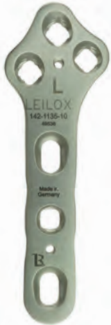
LeiLox TPLO Locking Plate, 3.5 mm, left, 66 mm, stainless steel