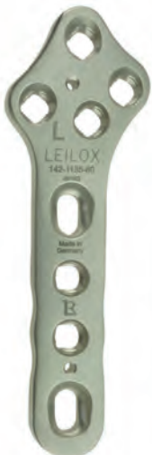
LeiLox TPLO Locking Plate, broad, 3.5 mm, left, 75 mm, stainless steel