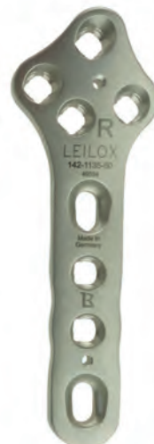
LeiLox TPLO Locking Plate, broad, 3.5 mm, right, 75 mm, stainless steel